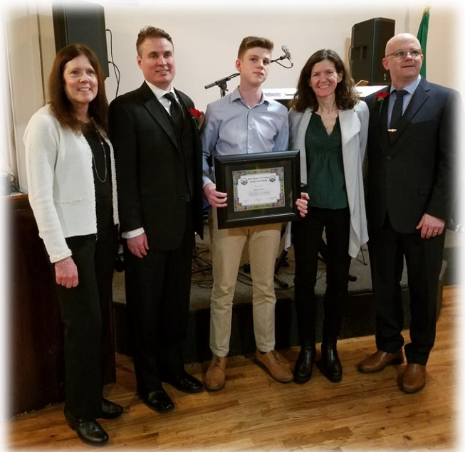
HON. JAMES A. FARLEY CONGRATULATES NEW CORK MEN'S ASSN. PRESIDENT